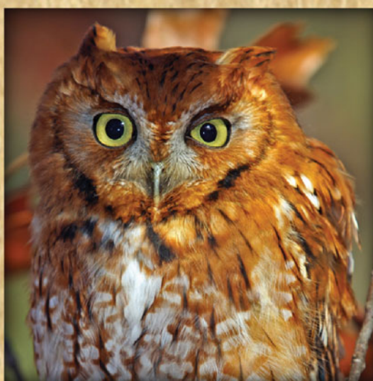
Eastern Screech-Owl Megascops asio