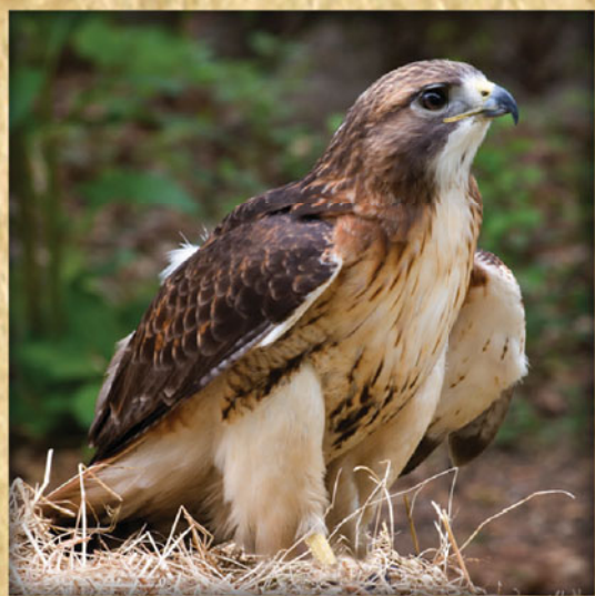
Red-Tailed Hawk Buteo jamaicensis