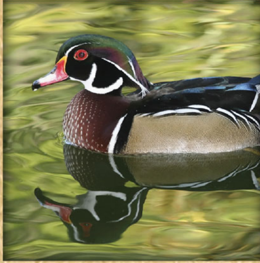
Wood Duck Aix sponsa