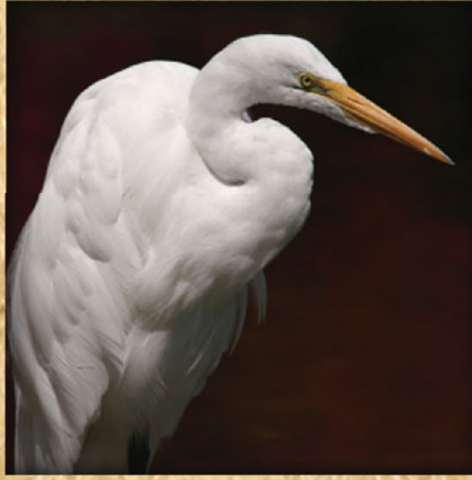
Great Egret Ardea alba