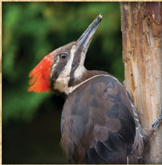
Pileated Woodpecker Dryocopus pileatus