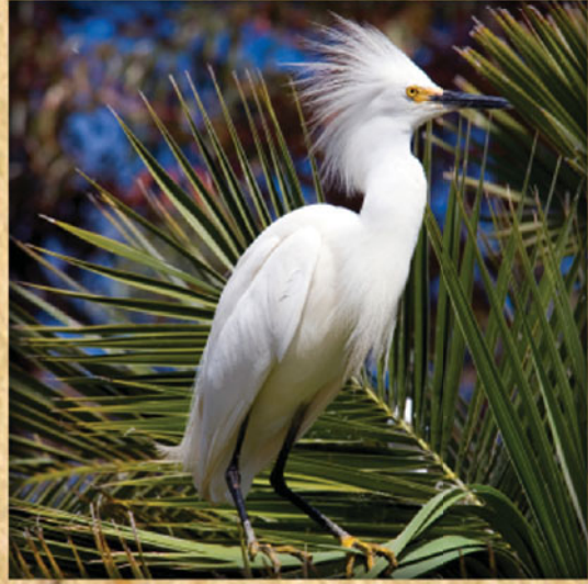
Snowy Egret Egretta thula