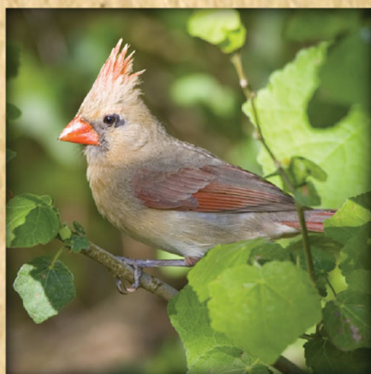
Northern Cardinal ♀ Cardinalis cardinalis female