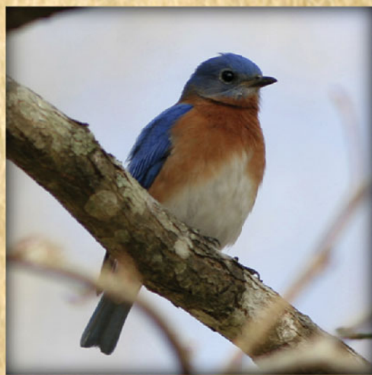
Eastern Bluebird Sialia sialis