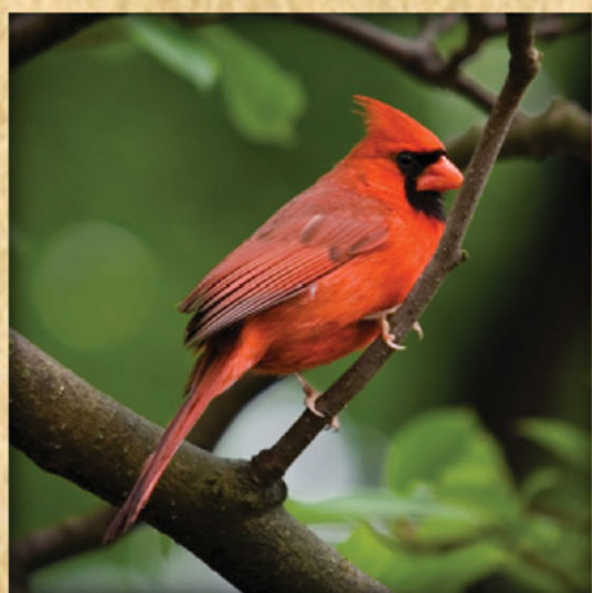
Northern Cardinal ♂ Cardinalis cardinalis male