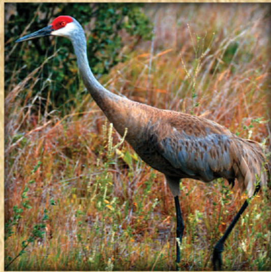
Sandhill Crane Grus canadensis