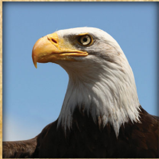
Bald Eagle Haliaeetus leucocephalus