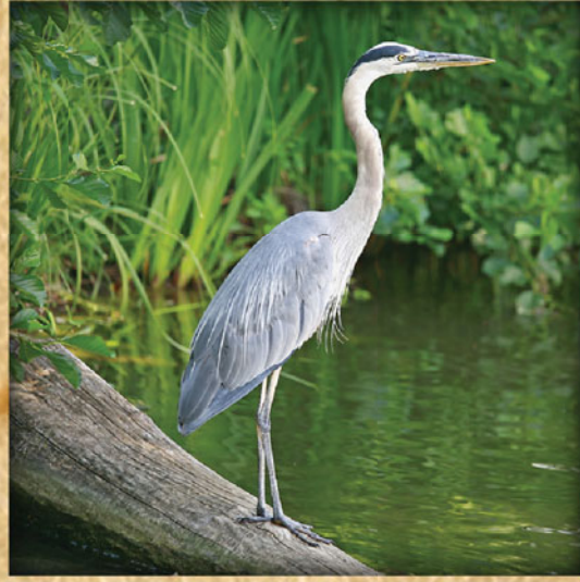
Great Blue Heron Ardea herodias