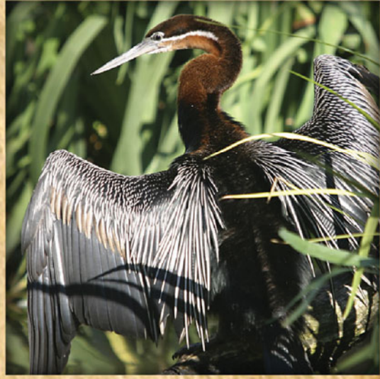
Anhinga Anhinga anhinga