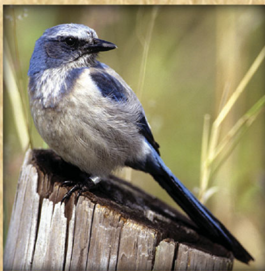
Florida Scrub-Jay Aphelocoma coerulescens