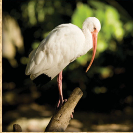
White Ibis Eudocimus albus