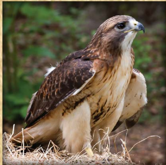
Red-Tailed Hawk Buteo jamaicensis