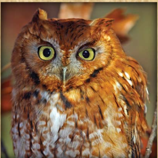
Eastern Screech-Owl Megascops asio

Through its efforts to protect water resources, the Southwest Florida Water Management District buys and manages land. As a result, plants and animals that live on these lands are also protected and the public can enjoy recreational and educational activities in the great outdoors. For a more comprehensive list containing birds, mammals, butterflies, frogs, toads, insects, trees, shrubs, reptiles, wildflowers and natural communities, please visit