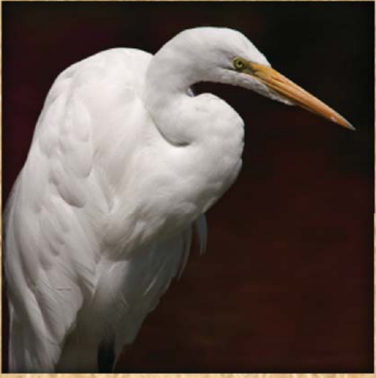
Great Egret Ardea alba