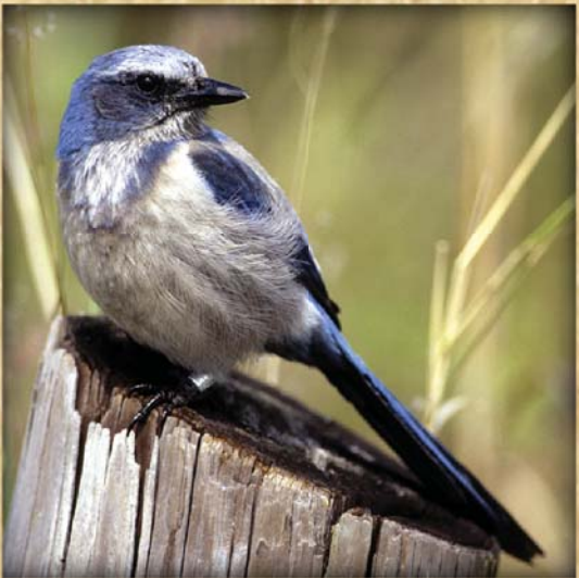
Florida Scrub-Jay Aphelocoma coerulescens