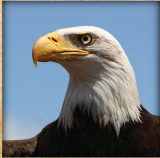
Bald Eagle Haliaeetus leucocephalus