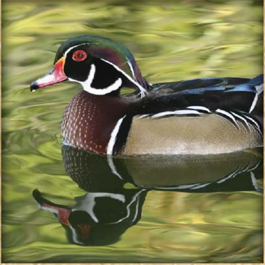
Wood Duck Aix sponsa