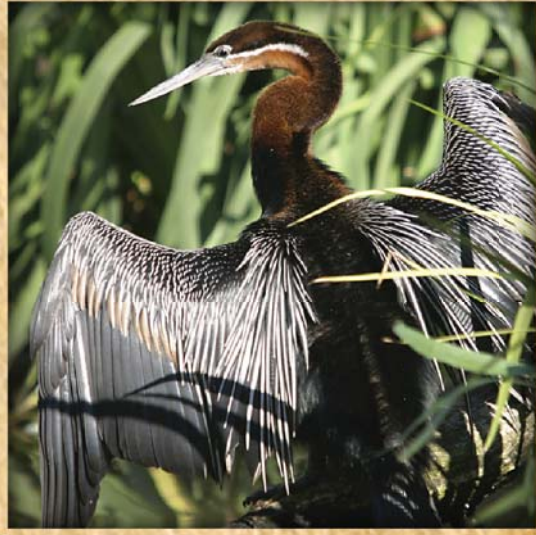
Anhinga Anhinga anhinga