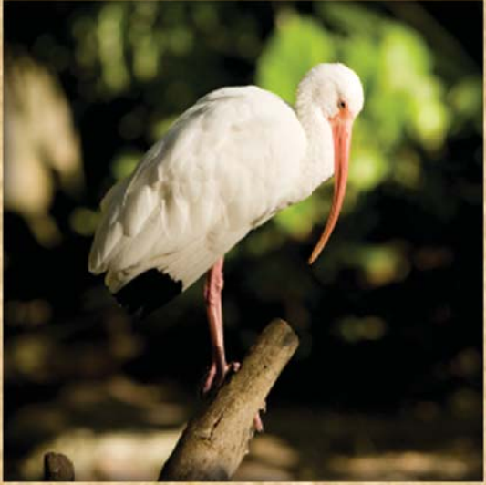
White Ibis Eudocimus albus