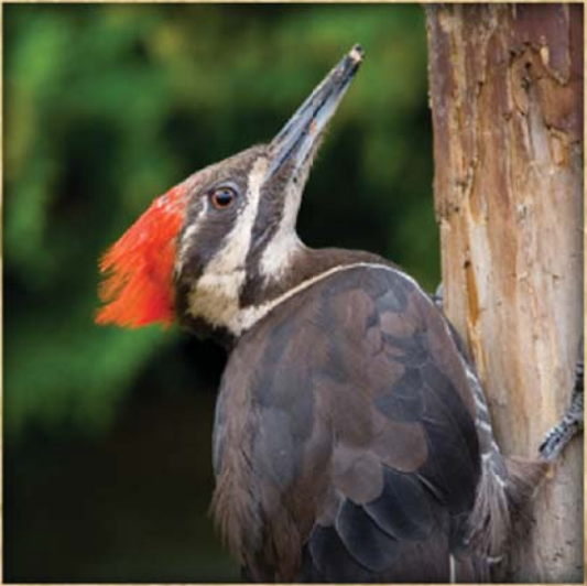
Pileated Woodpecker Dryocopus pileatus