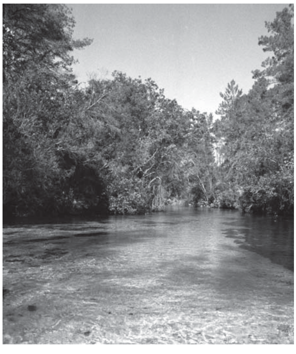
The Weeki Wachee River is an example of a spring-fed river.

In the southern portion of the District, the intermediate aquifers serve as an important source of water supply. Polk, Sarasota, Highlands, Hardee, DeSoto and Charlotte counties rely on the intermediate aquifers for public supply, agricultural irrigation and household uses.