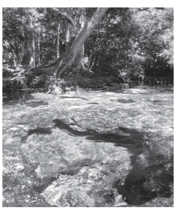
Chassahowitzka Springs is an example of groundwater discharging to surface water.

However, the majority of the rain that falls does not find its way into aquifers. Most rainfall returns to the atmosphere through evaporation and transpiration, or runs off across the land into surface water bodies. A variety of factors,