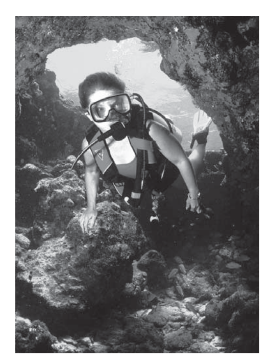
A diver explores part of the Upper Floridan aquifer through a spring.

While the groundwater within Florida's aquifers remains unseen, it still serves a vital role in maintaining the quality of life for all Floridians. The District is responsible for protecting this important resource.