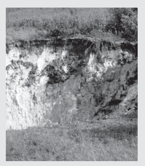
An example of a sinkhole.

Karst terrain describes a type of landscape that has been formed by the dissolution of the underlying rock. The thick layers of limestone and dolomite rocks that underlie Florida are easily dissolved by weak acid that naturally occurs in rainfall. The water dissolves the rock to form openings through which water readily flows. As the rock dissolves, it can cause the surface area above it to collapse, creating a sinkhole. Karst areas are characterized by an abundance of sinkholes, springs and caverns.