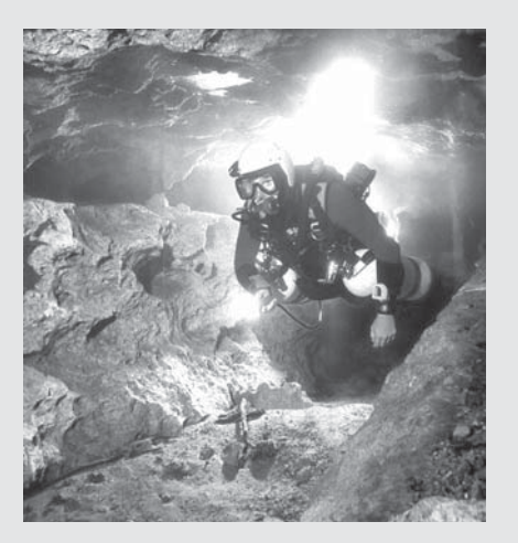
A diver enters an aquifer through a spring.

Most springs within the District are in good condition, but some show signs of stress. Contaminants from fertilizers and human and animal waste have steadily increased in some springs since the 1950s and 1960s. This raises concerns about the future of spring health and groundwater quality.