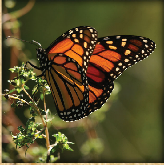
Monarch Danaus plexippus