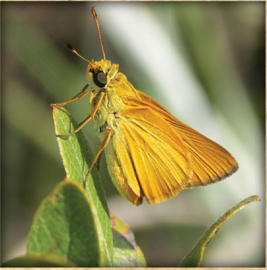
Delaware Skipper Anatrytone logan