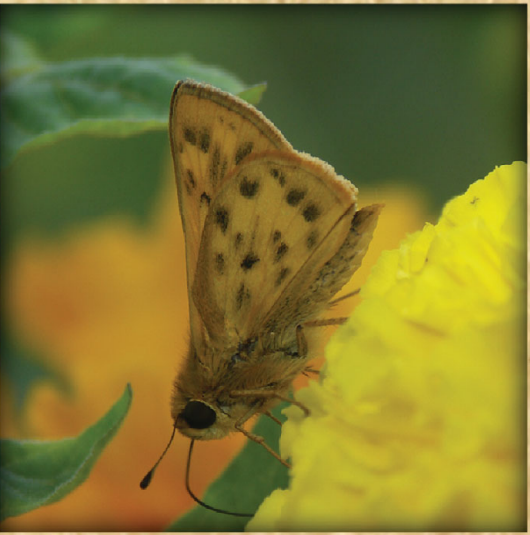
Fiery Skipper Hylephila phyleus