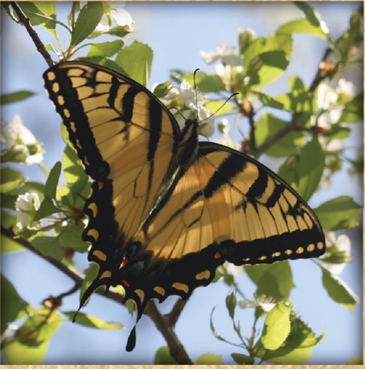
Eastern Tiger Swallowtail Papilio glaucus