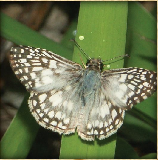
Tropical Checkered-Skipper Pyrgus oileus