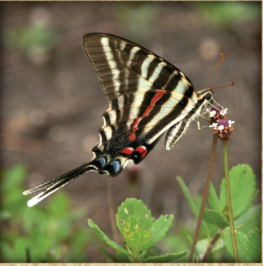
Zebra Swallowtail Eurytides marcellus