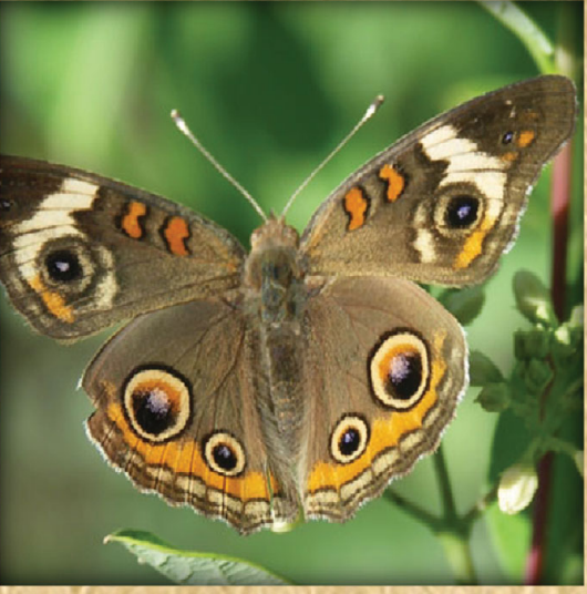
Common Buckeye Junonia coenia