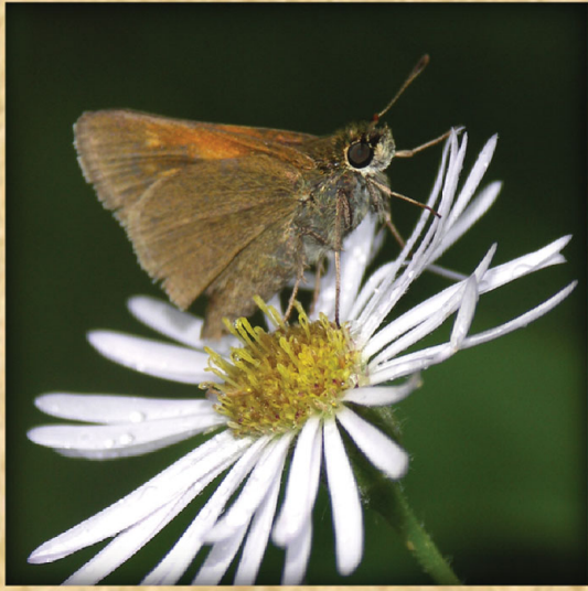
Tawny-Edged Skipper Polites themistocles