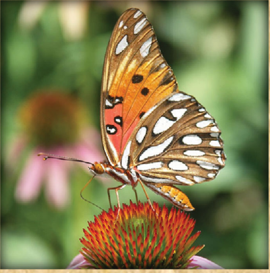
Gulf Fritillary Agraulis vanillae