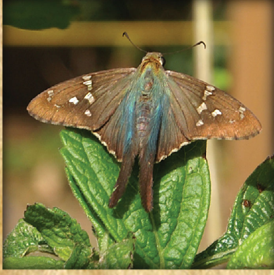
Long-Tailed Skipper Urbanus proteus