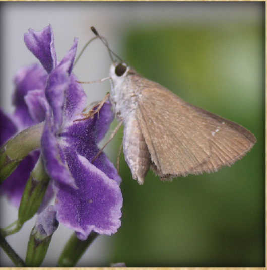
Eufala Skipper Lerodea eufala

Through its efforts to protect water resources, the Southwest Florida Water Management District buys and manages land. As a result, plants and animals that live on these lands are also protected and the public can enjoy recreational and educational activities in the great outdoors. For a more comprehensive list containing birds, mammals, butterflies, frogs, toads, insects, trees, shrubs, reptiles, wildflowers and natural communities, please visit