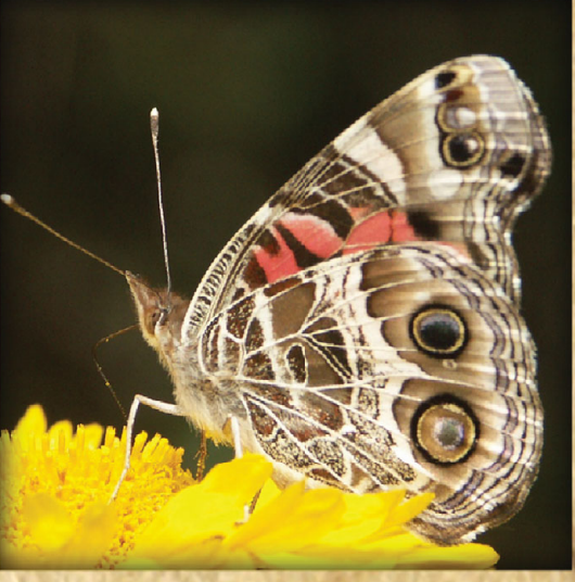
American Lady Vanessa virginiensis