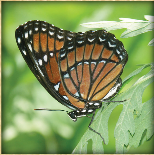
Viceroy Limnitis archippus