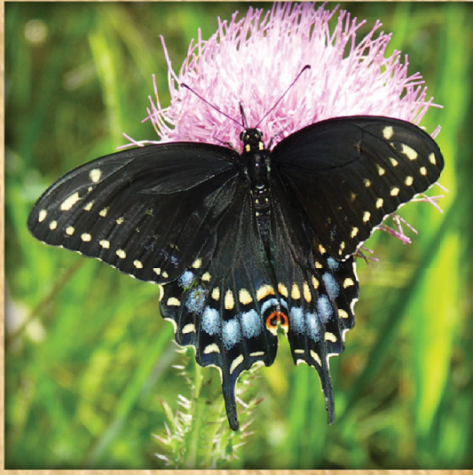
Black Swallowtail Papilio polyxenes