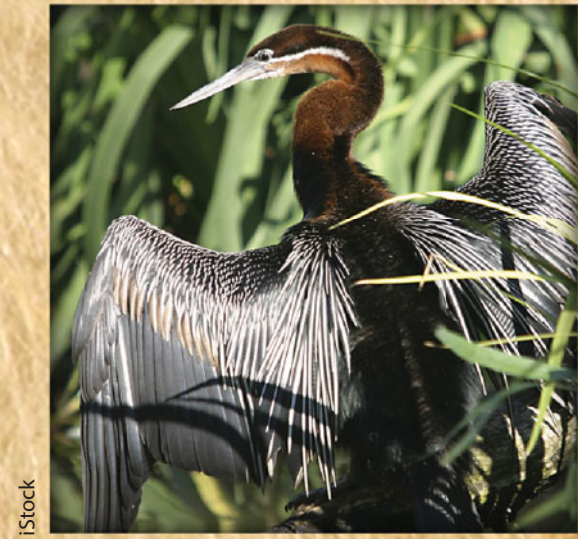
Anhinga Anhinga anhinga