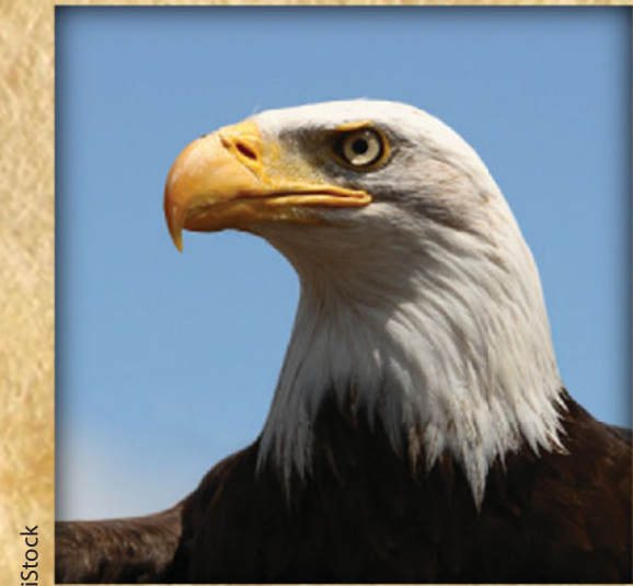
Bald Eagle Haliaeetus leucocephalus