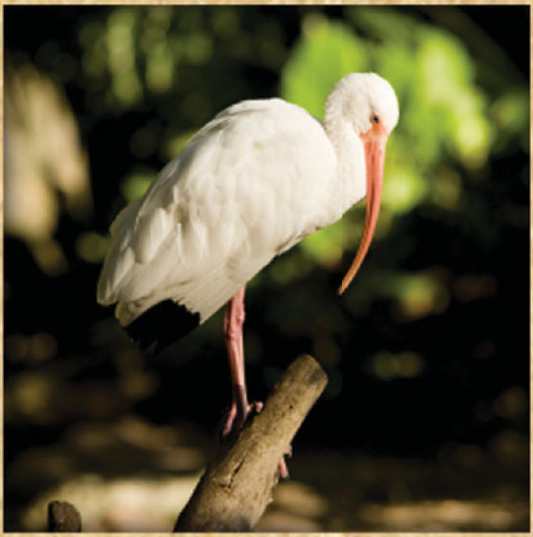
White Ibis Eudocimus albus