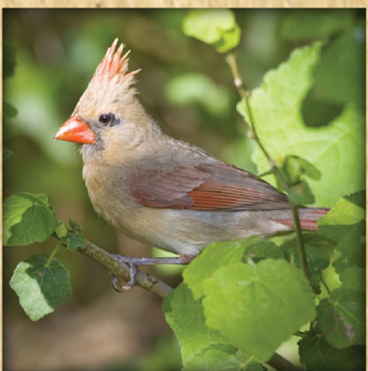
Northern Cardinal Cardinalis cardinalis ♀ female