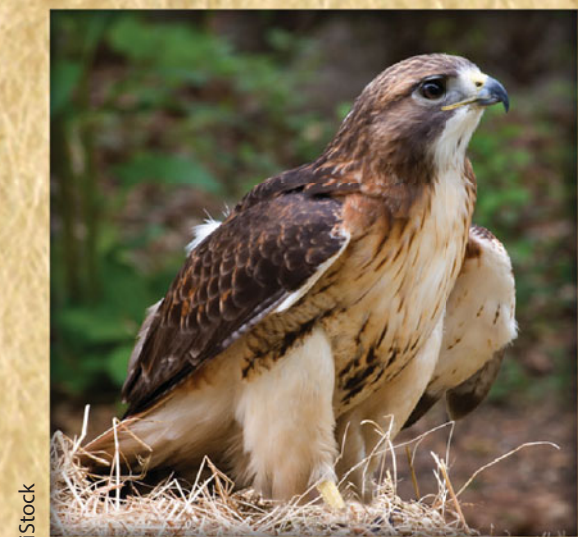
Red-Tailed Hawk Buteo jamaicensis