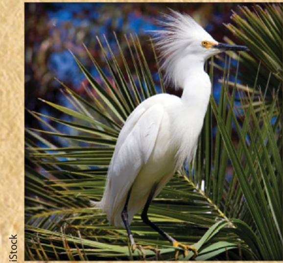
Snowy Egret Egretta thula