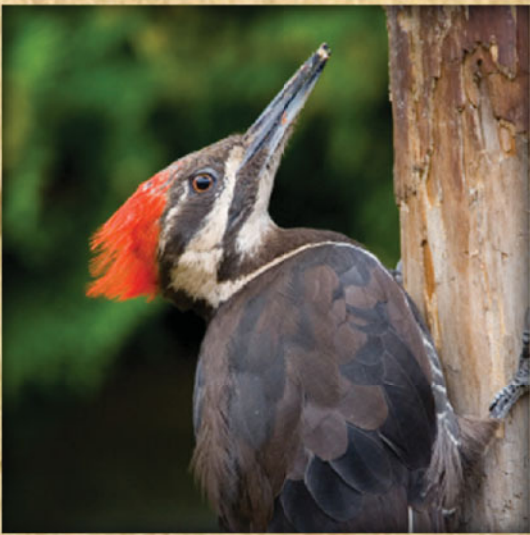
Pileated Woodpecker Dryocopus pileatus