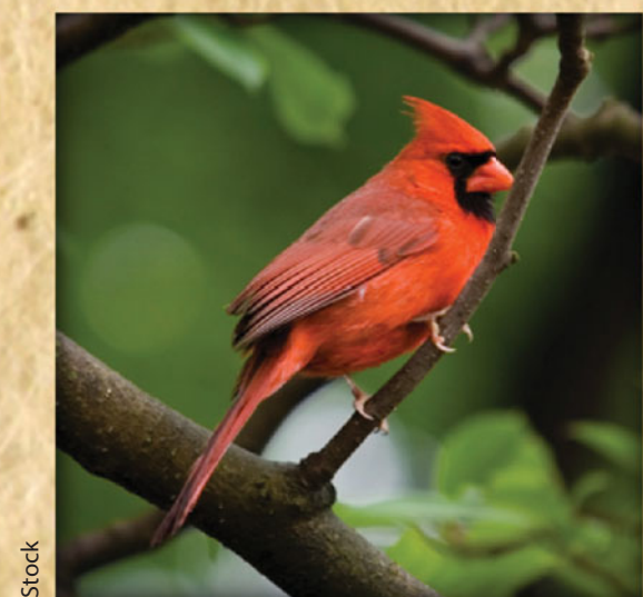
Northern Cardinal Cardinalis cardinalis ♂ male