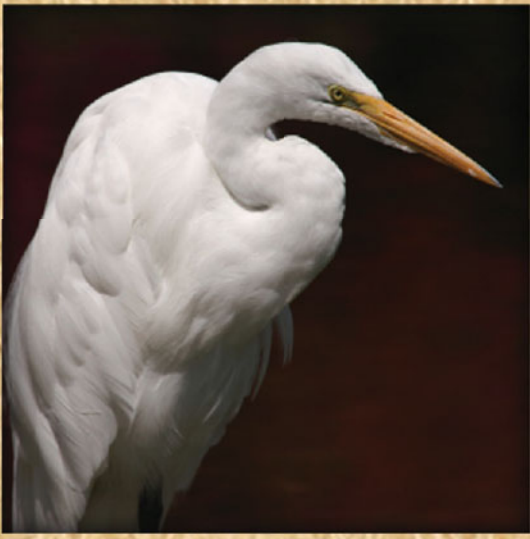
Great Egret Ardea alba