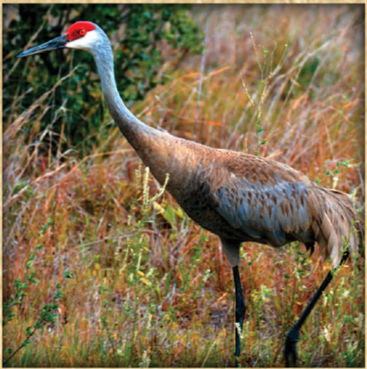
Sandhill Crane Grus canadensis