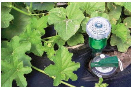
Soil Moisture Metering