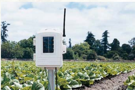
Field Soil Moisture Telemetry