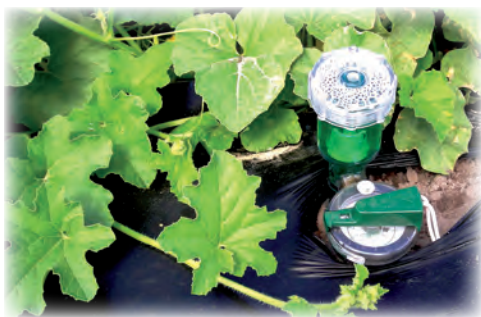
Soil Moisture Metering