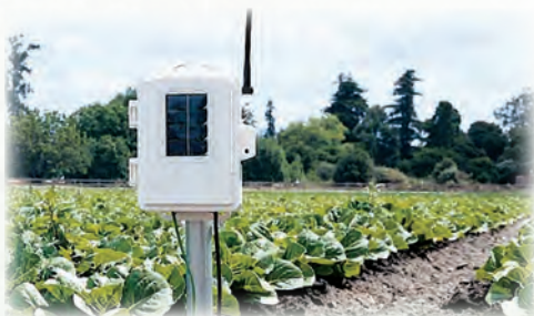
Field Soil Moisture Telemetry