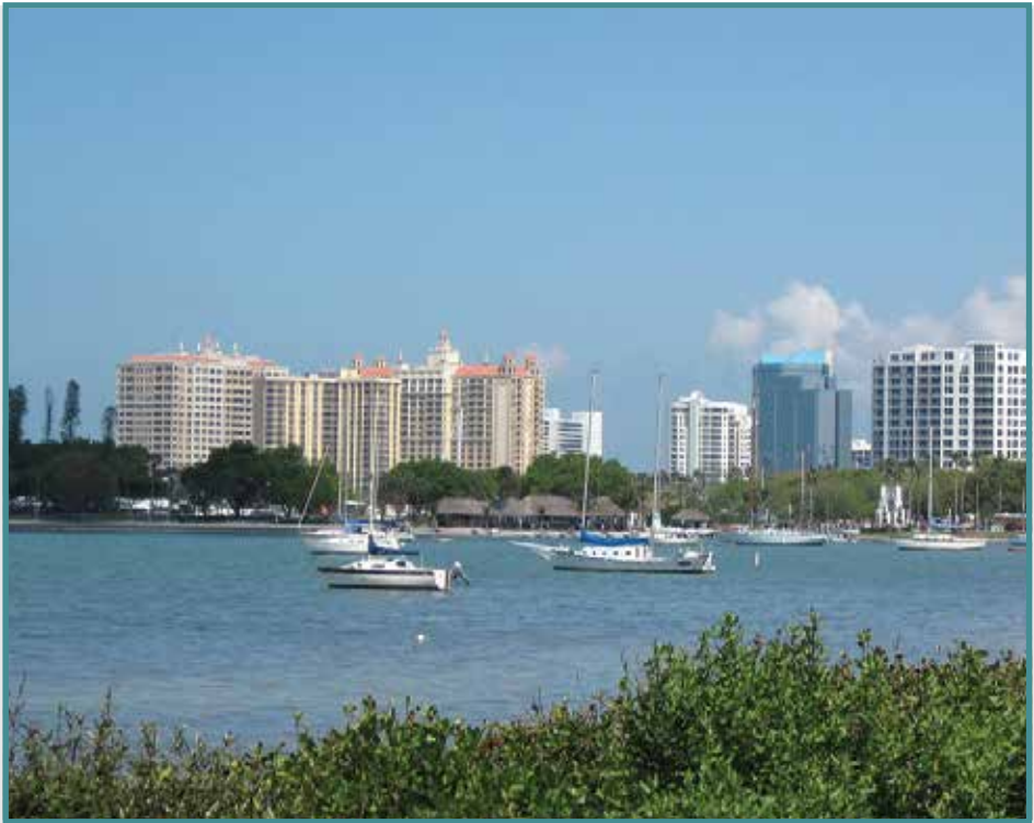
Sarasota Bay

Additionally, analysis of historical surface and groundwater quality conditions in the Shell Creek watershed, along with implementation of BMPs, suggest that the surface waters within Shell Creek may naturally exceed Class I drinking water standards. Monitoring of key locations will continue in cooperation with the DEP.