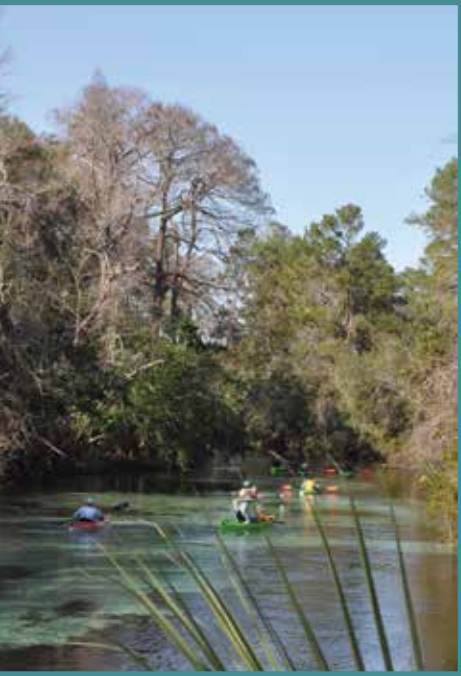
Weeki Wachee River in Hernando County

Each SWIM plan is a road map, a living document with adaptive management at its core. These plans identify management actions, projects that address the issues facing each system, and specific quantifiable objectives to assess overall progress and help guide the SCSC. In an August 2017 workshop the Board prioritized combining District funds with state and local funds for projects that would connect domestic septic systems to central sewer to benefit springs. The Board also identified the need to protect the District investment by ensuring controls are in place to prevent additional pollution from new septic systems.