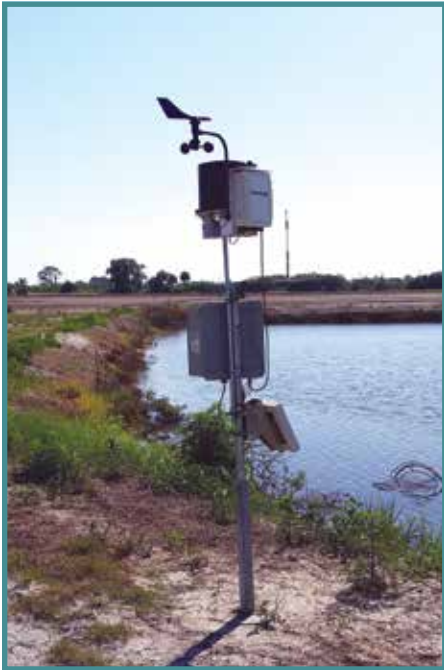
Weather Station in Hillsborough County

and pumped 75 percent of this volume over the City of Tampa dam when necessary. To further support recovery of the lower river, the City of Tampa has been supplying up to 18 cubic feet per second of flow from Sulphur Springs to the base of the City of Tampa dam. A project to develop additional augmentation quantities for the lower Hillsborough River from Blue Sink was completed in September 2017. The District is also helping fund the City of Tampa’s augmentation project to evaluate the use of reclaimed water to augment water supplies. A recharge/recovery system is being investigated to store and recover reclaimed water in the Floridan aquifer system for subsequent delivery to the Hillsborough River Reservoir.