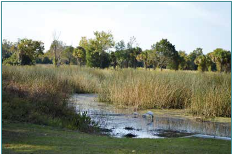
Three Sisters Springs in Crystal River