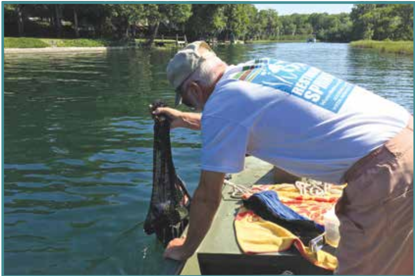
Rainbow River cleanup in Dunnellon