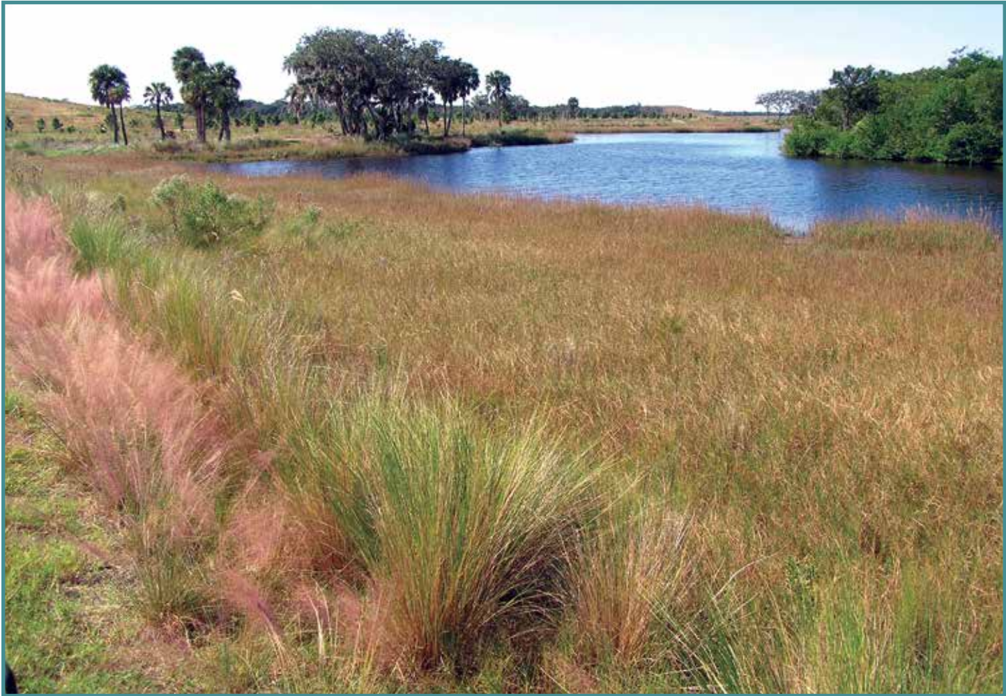
Rock Ponds project involves the restoration of approximately 1,043 acres of various coastal habitats. This project, which is the largest habitat restoration effort for Tampa Bay to date, was completed in cooperation with Hillsborough County.

trophic state index and chlorophyll-a as the success indicators for Lake Seminole. Control of excessive nutrients entering the lake and the fate of the nutrients that do reach the lake (e.g., internal nutrient recycling) would help in achieving the targets, which is consistent with implementation of the Lake Seminole Watershed Management Plan.