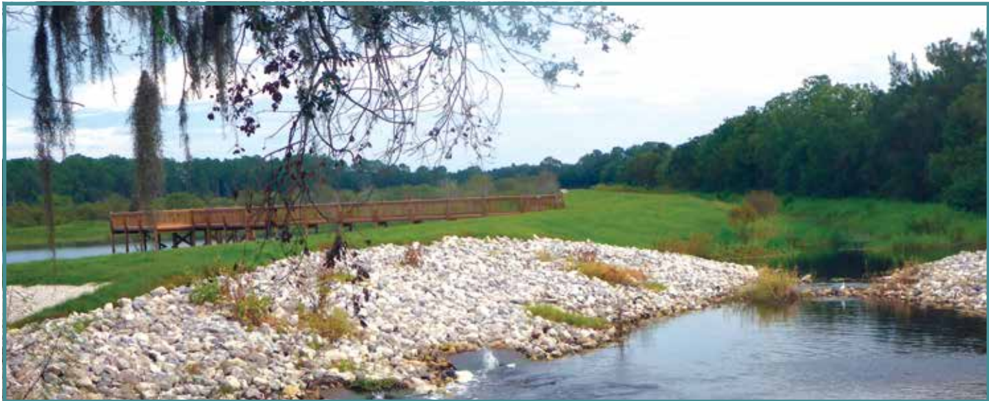
Lake Gwyn, Polk County

As of 2017, the District is initiating an evaluation of the Ridge Lakes to prioritize lakes for further evaluation to determine the projects and programs necessary to ensure that the Ridge Lakes meet the water quality objectives of the District. Success indicators will be measured by water quality improvements including reductions in non-point source loading of nutrients, decreases in nonnative or undesirable species and increases in native aquatic and upland vegetation. In addition, lakes with sufficient water quality data will be evaluated against the DEP's numeric nutrient criteria.