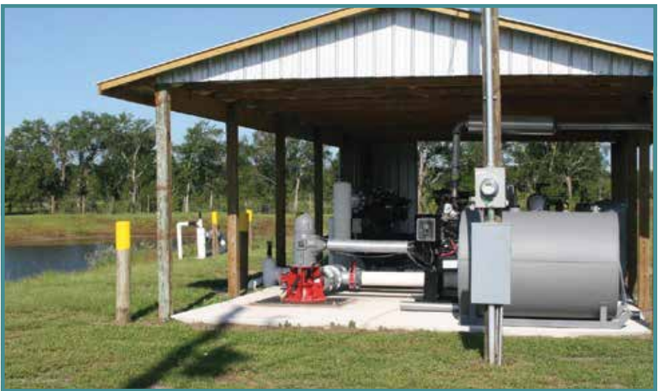
Surface Water Pump Station at Windmill Farms, Hardee County