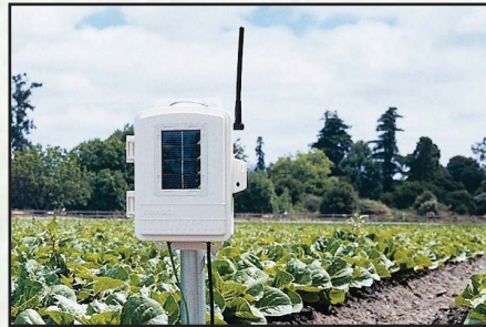
Field Soil Moisture Telemetry