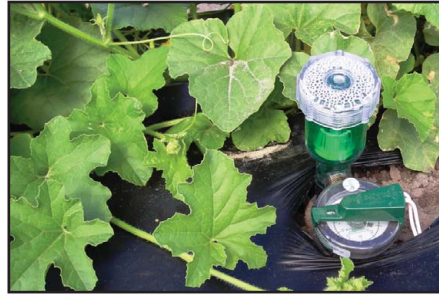
Soil Moisture Metering

*A quick link to FDACS-adopted BMPs can be found at WaterMatters.org/FloridaBMPs