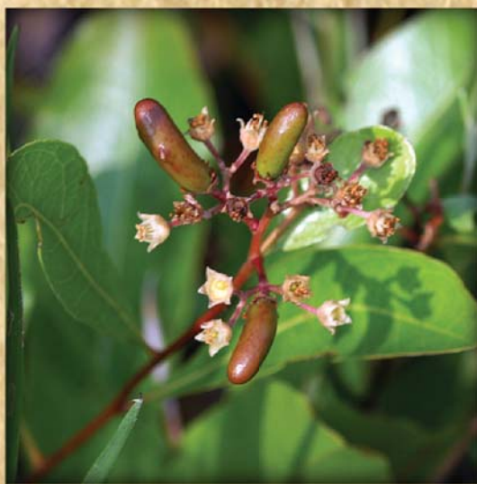
Gopher Apple Licania michauxii