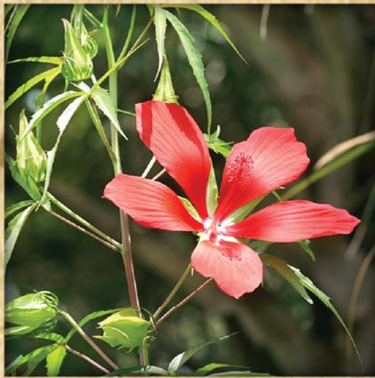
Scarlet Rosemallow Hibiscus coccineus