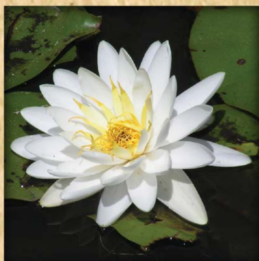
American White Waterlily Nymphaea odorata