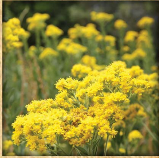
Goldenrod Solidago sp.