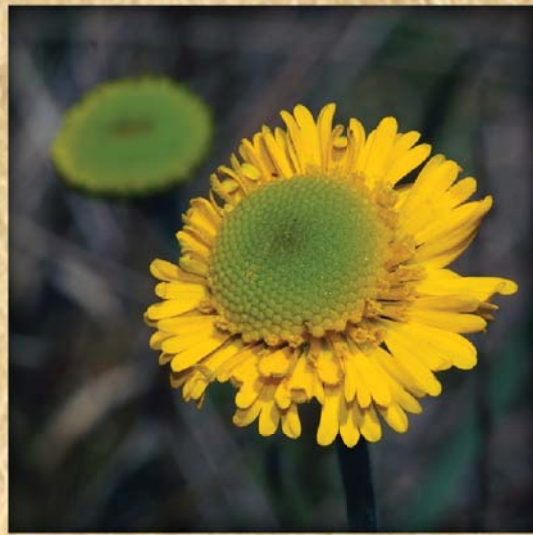
Southeastern Sneezeweed Helenium pinnatifidum