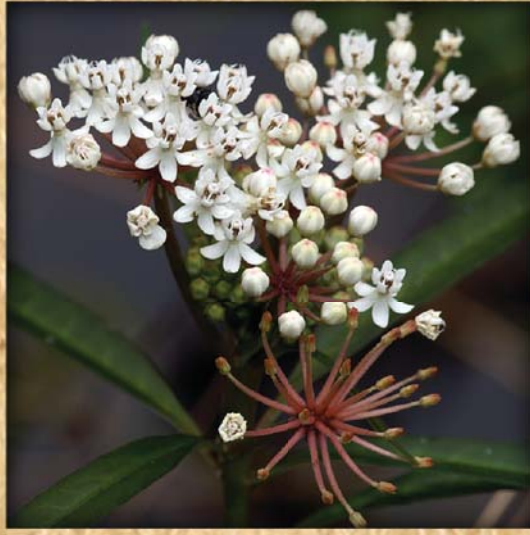
Swamp Milkweed Asclepias perennis