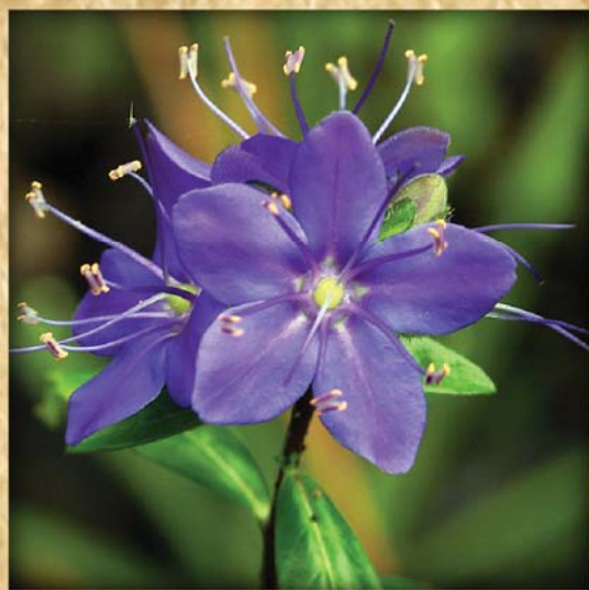
Skyflower Hydrolea corymbosa