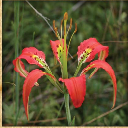
Pine Lily Lilium catesbaei