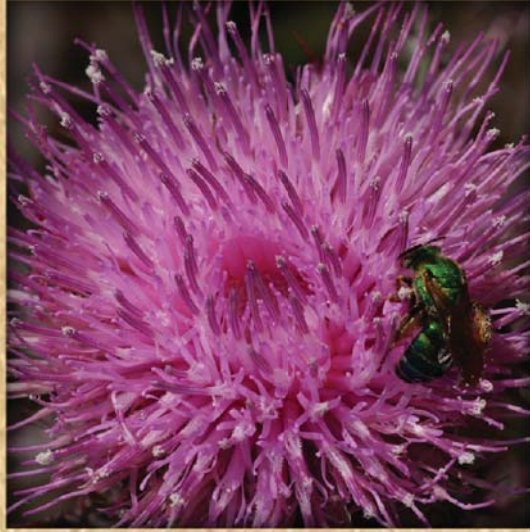
Purple Thistle Cirsium horridulum