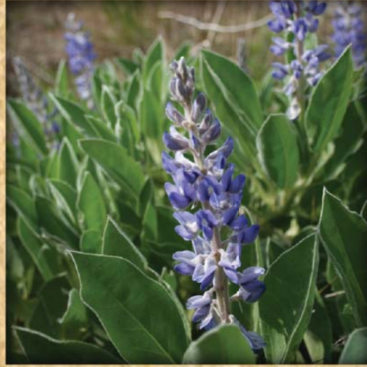
Sky-Blue Lupine Lupinus diffusus