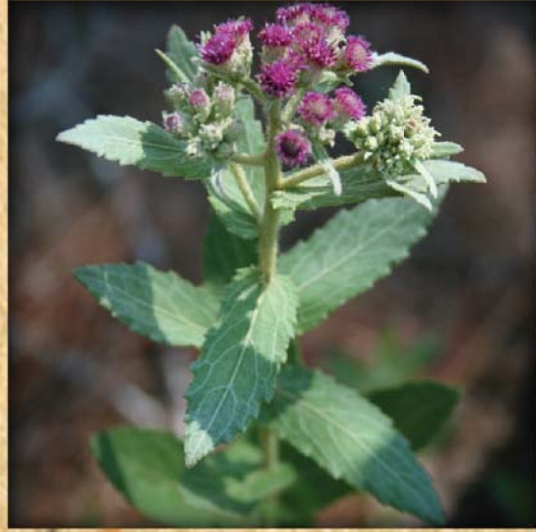
Rosy Camphorweed Pluchea baccharis