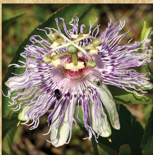
Purple Passionflower Passiflora incarnata

Through its efforts to protect water resources, the Southwest Florida Water Management District buys and manages land. As a result, plants and animals that live on these lands are also protected and the public can enjoy recreational and educational activities in the great outdoors. For a more comprehensive list containing birds, mammals, butterflies, frogs, toads, insects, trees, shrubs, reptiles, wildflowers and natural communities, please visit