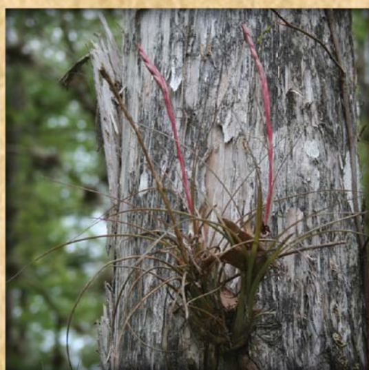
Florida Air Plant Tillandsia simulata