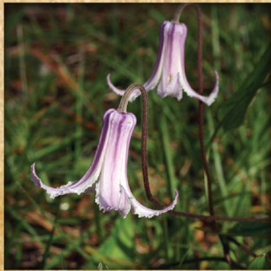
Pine Hyacinth Clematis baldwinii