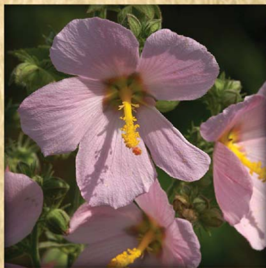
Virginia Saltmarsh Mallow Kosteletzkya pentacarpos