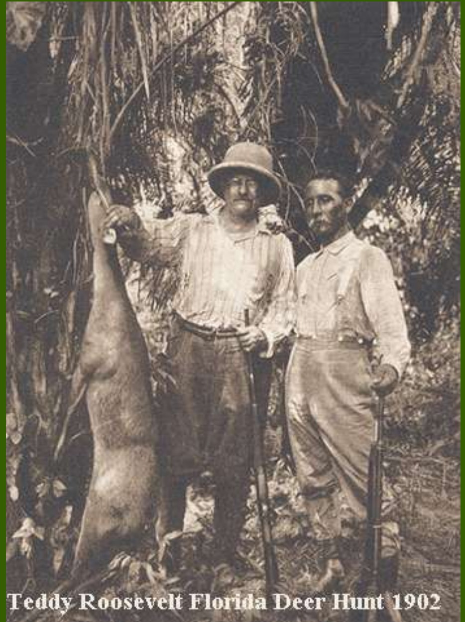
Teddy Roosevelt Florida Deer Hunt 1902

Hunters, like John James Audubon & Theodore Roosevelt, were some of the first conservationists. That love affair with nature lives on today in the heart of the hunter. Legal hunting by sportsmen has never caused the extinction of any species. In fact, hunters do more for the environment than any other single user group.